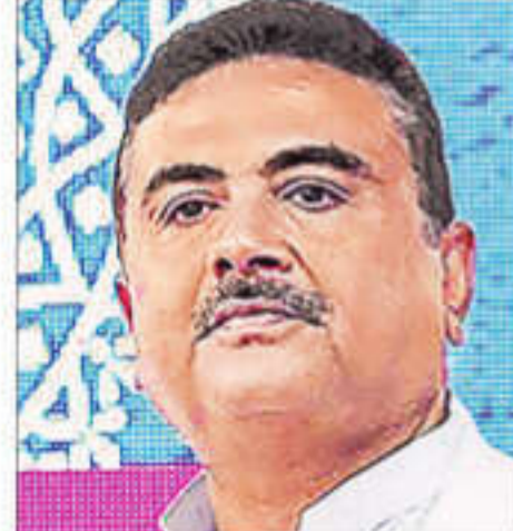
West Bengal CM Suwendu Adhikari

WEST BENGAL CHIEF Minister Suwendu Adhikari on Saturday said that railway projects worth around ₹1 lakh crore would be undertaken in the state, and directed officials to come up with a schedule for handing over the required land.